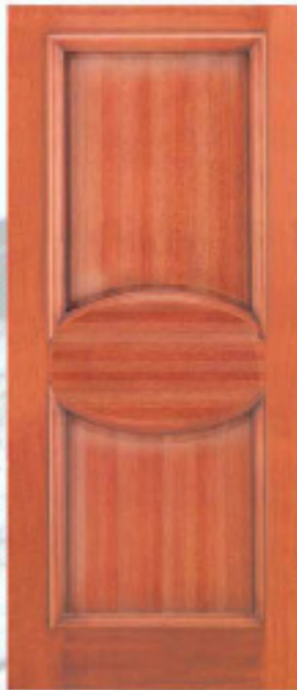
Fox Senior Panel - "F" Oak

70012F 2 Panel - Straight Top Rail w/Oval Lock Rail