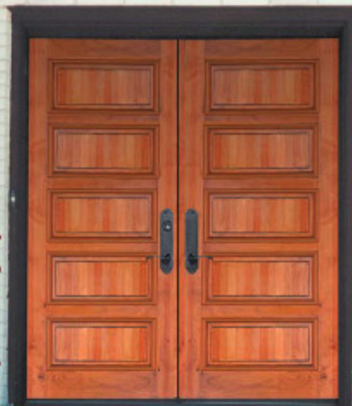
Junior Hip Panel - "J" Select Alder Double Door • Pewter Hardware

Exterior doors are standard 1-3/4" thick and available 2-1/4" thick