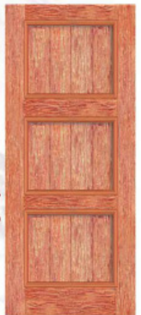
Manked Panel - "P" Pine Rocky Mountain Distress