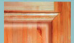
Fox Senior Panel - "F"

All doors feature butcher block design construction except interior doors made from pine or knotty alder