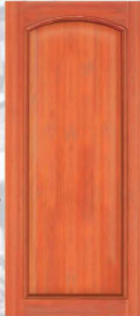
Fox Senior Panel - "F" Soft Maple