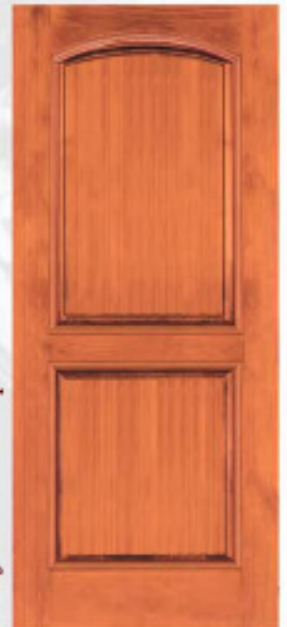
Junior Hip Panel - "J" Select Alder

71004J 4 Panel - (Shown with 1 1/2" panel height)