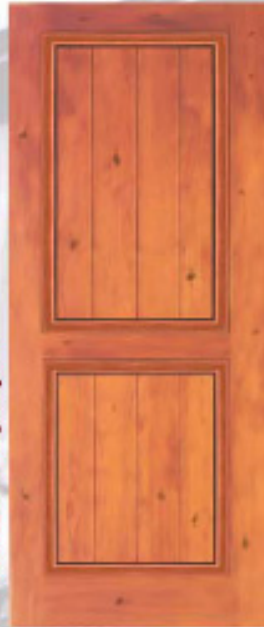
Manked Panel - "P" Pine