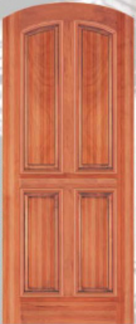
Junior Hip Panel - "J" Oak

71004J 4 Panel - (Shown with 1 1/2" panel height)