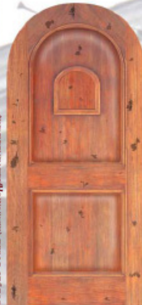
Fox Senior Panel - "F" Knotty Alder Arch Speakeasy Door

60252F 2 Panel - (Shown with Upgrade Full Radius Arch)