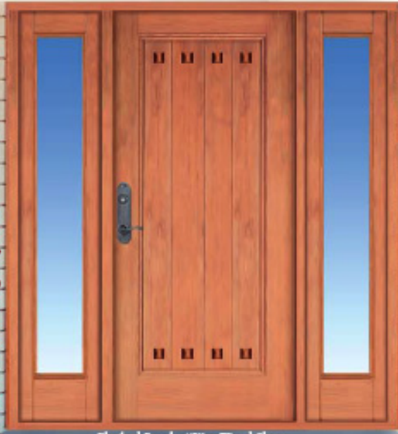
Planked Panel - "P" w/Wood Clasps Soft Maple • Pewter Hardware

60252F 2 Panel - (Shown with Upgrade Full Radius Arch)