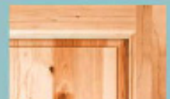
Junior Hip Panel - "J"

All doors feature butcher block design construction except interior doors made from pine or knotty alder