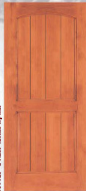
Planked Panel - "P" Select Alder