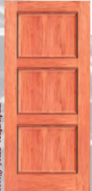
Junior Hip Panel - "J" Oak

For a complete catalog listing, visit our website: www.autumnwood.com