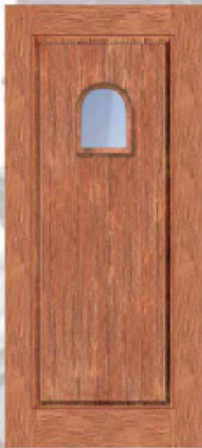
Junior Hip Panel - "J" Select Alder Rocky Mountain Distress Arch Glass Window