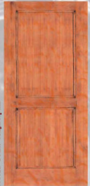
Butcher Block Panel - "B" Soft Maple Adzing Distress